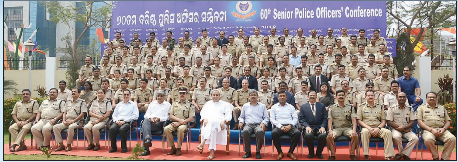
Delegates with Hon'ble CM on the Valedictory Session of the 60th Senior Police Officers' Conference, Bhubaneswar