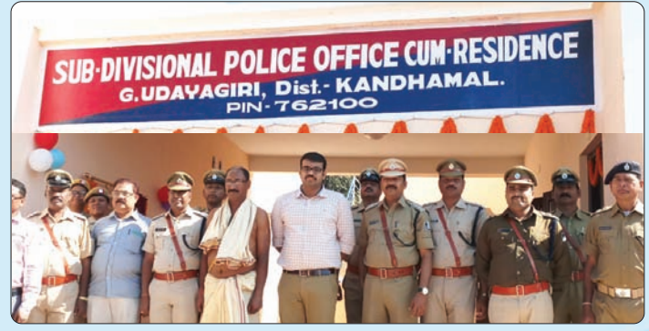
Sh Mitrabhanu Mohapatra, SP inaugurating the new building of SDPO, G. Udayagiri in Kandhamal District