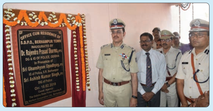
DGP inaugurating the New Building of SDPO, Berhampur