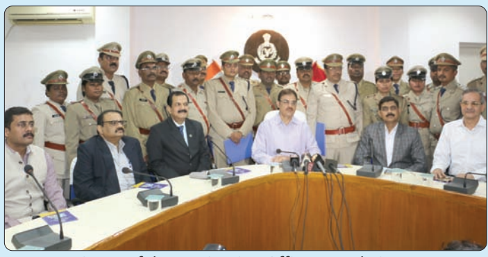
Successful Investigating Officers are being felicitated by DGP for securing conviction in heinous offences.