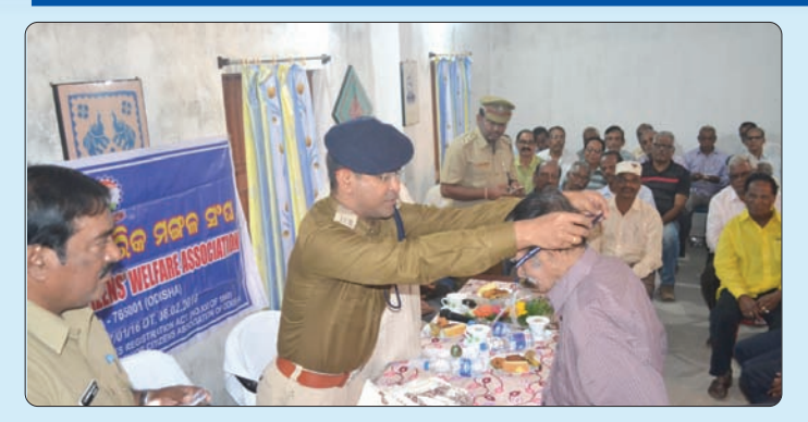
Distribution of Identity Cards to senior citizens by Rayagada police