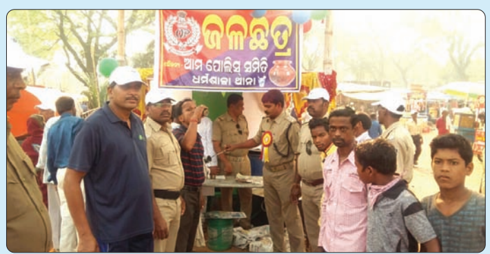
Opening of "Jala Chhatra" by Ama Police Samiti, Dharmasala PS in Jajpur District