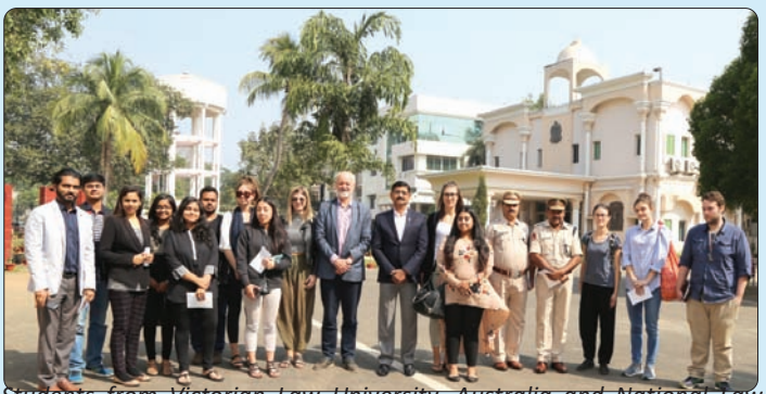
Students from Victorian Law University, Australia and National Law University, Cuttack visiting State Police Hdqrs. to study police system in Odisha