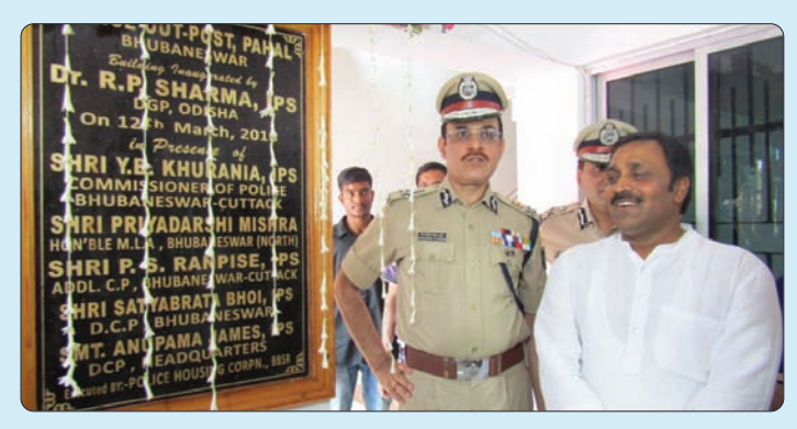
DGP inaugurating the newly created Pahala OP in UPD Bhubaneswar