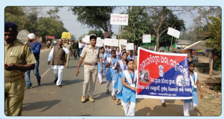
Road Safety Awareness Campaign by Rasagovindapur PS in Mayurbhanj District