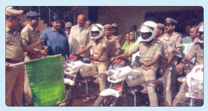
Launching of 24 × 7 Bike Patrol by Koraput Police