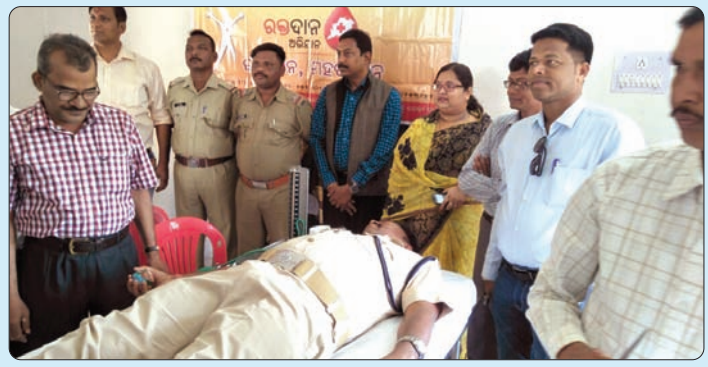
Blood Donation Camp organised by Tarava PS in Subarnapur District