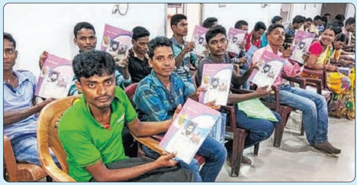
Koraput Police helping the surrendered maoists to pursue their education at IGNOU, Koraput