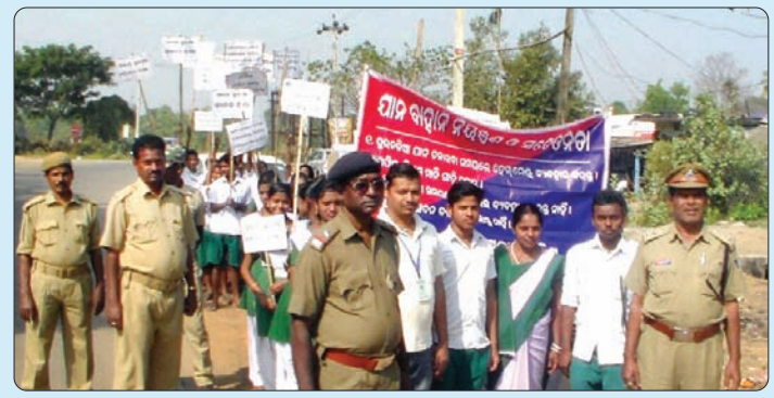
Traffic Awareness programme by Kaptipada PS in Mayurbhanj District