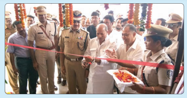
Inauguration of Traffic Police Station at Chandikhol