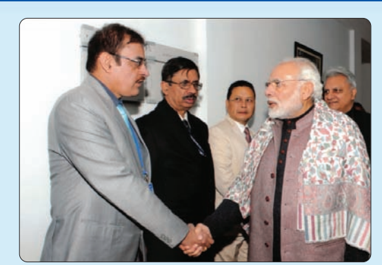
Dr RP Sharma, DGP with Hon'ble Prime Minister during the All India DGP Conference at Tekanpur, Gowalior.