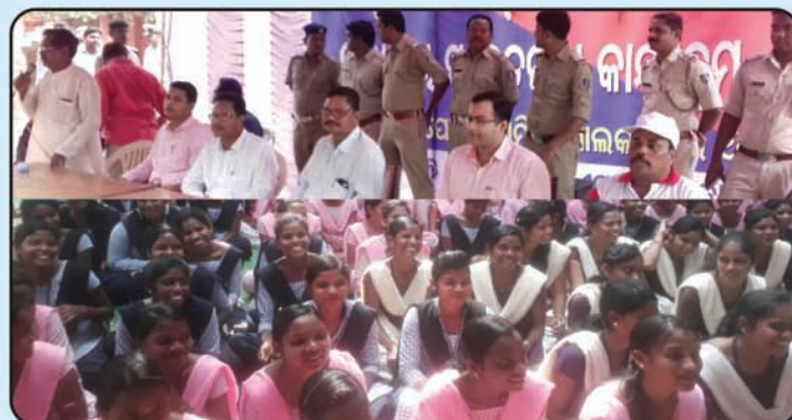
Cyber Crime & Traffic Awareness Programme organised by 'Ama Police Samiti' Malkangiri PS