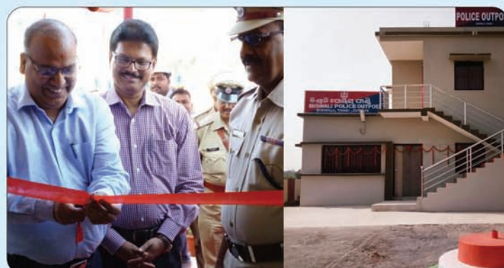
Sh Soumendra Priyadashi, IGP, Central Range inaugurating the New Building of Biswali OP (OCL) under Tangi PS, Cuttack