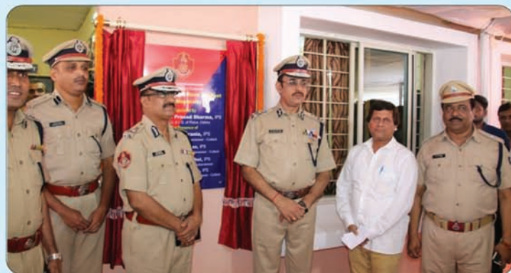
DGP inaugurating the Magnetic Chowk Out Post at Bhubaneswar