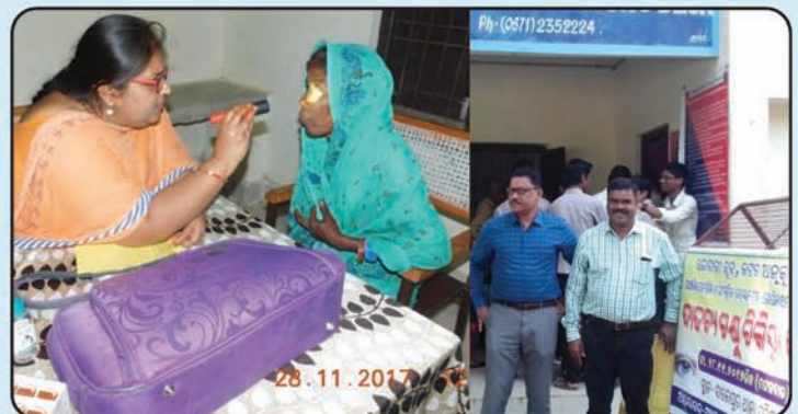
Free Eye Treatment Camp by 'Ama Police Samiti' Salepur PS in Cuttack District