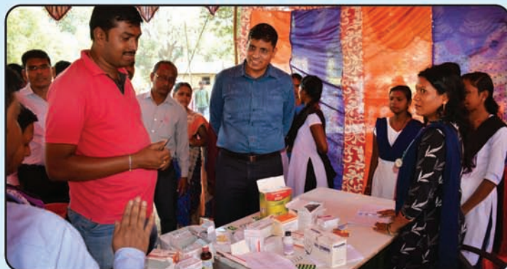
Free Health Camp organized by Sambalpur Police at village Badabahal in Kisinda PS Area