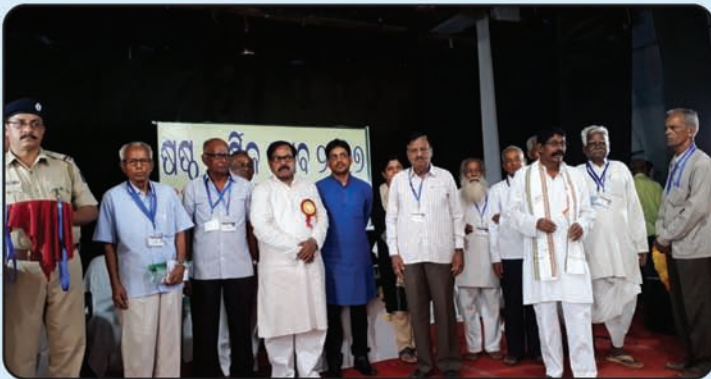
Distribution of Identity card to the Senior Citizens by Jatni PS