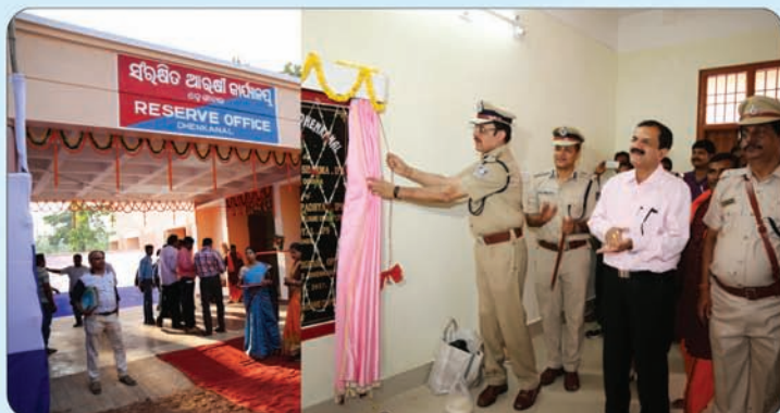
DGP inaugurating the New Building of RO, Dhenkanal