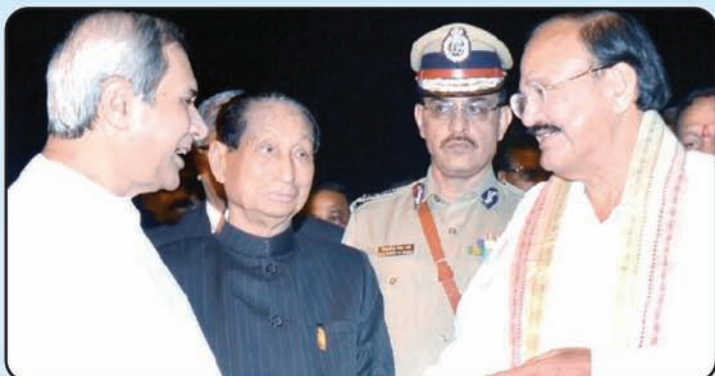
Sh M. Venkiya Naidu, Hon'ble Vice-President of India being received at the Airport