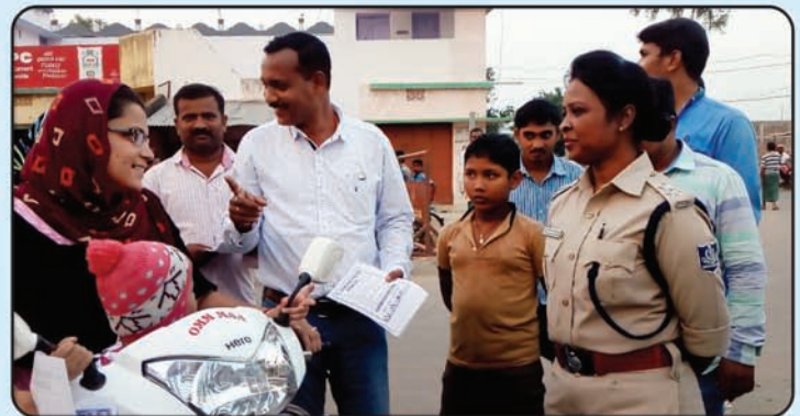
Traffic Awareness Programme by 'Ama Police Samiti', Patapur PS, Ganjam District