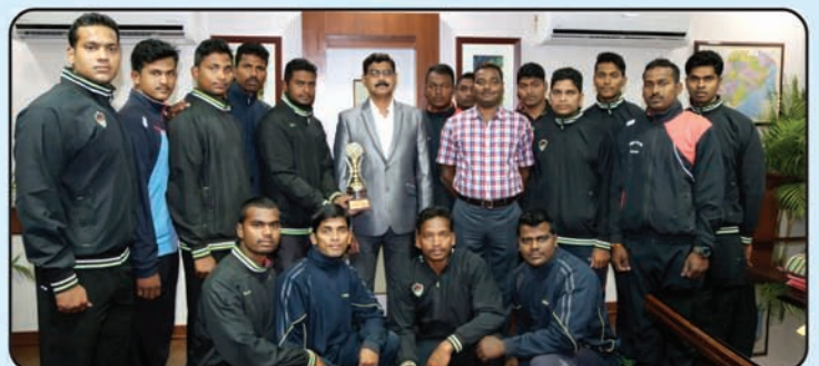
Odisha Police Handball Team own Championship Title in the Senior State Handball Championship, 2017 at Bhubaneswar.