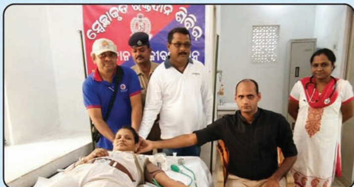
Blood Donation Camp organised by Korei PS, Jajpur Dist.