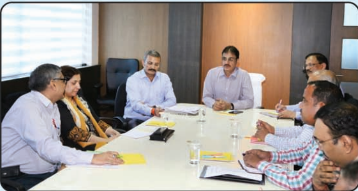
DGP presiding over the State level Security Committee meeting for Railways at Bhubaneswar