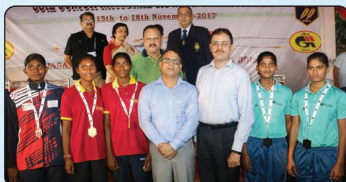
DGP with the medal winners at the 38 th Junion National Rowing Championship, 2017 at Jagatpur, Cuttack