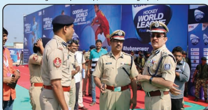
DGP reviewing the security arrangement on the eve of World Hockey League at Kalinga Stadium, Bhubaneswar