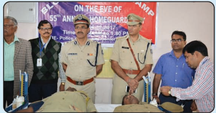
Blood Donation Camp organised by Sambalpur Police on the occasion of Home Guard's Raising Day