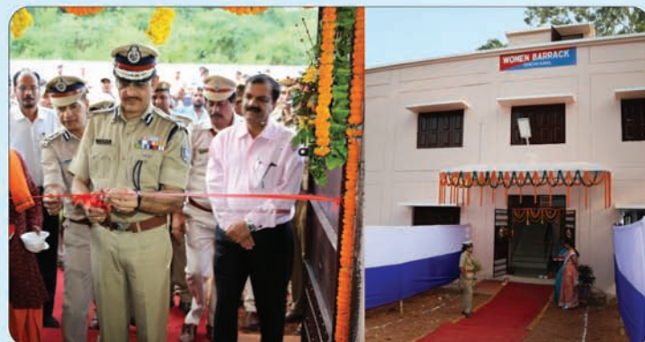
DGP inaugurating the 60 Beded Women Barrack at Dhenkanal