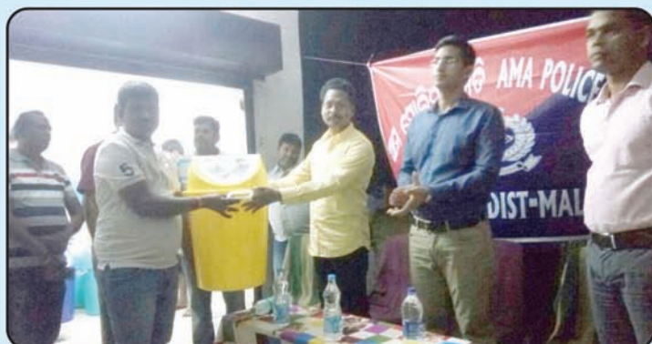
Free distribution of Dustbins to the shopkeepers of Gobindpalli Market by 'Ama Police Samiti' Mathili PS, Malkangiri Dist.