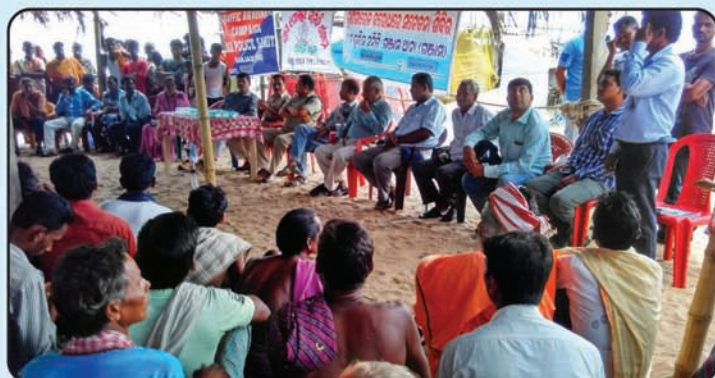
Witch Craft Awareness Programme by 'Ama Police Samiti' Ganjam PS