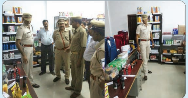
Inauguration of Subsidiary Police Canteen at RO, Jajpur