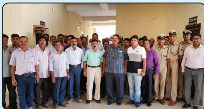
Staff of DPO, Berhampur taking pledge on the occasion of Sambidhan Diwas (Constitution Day)