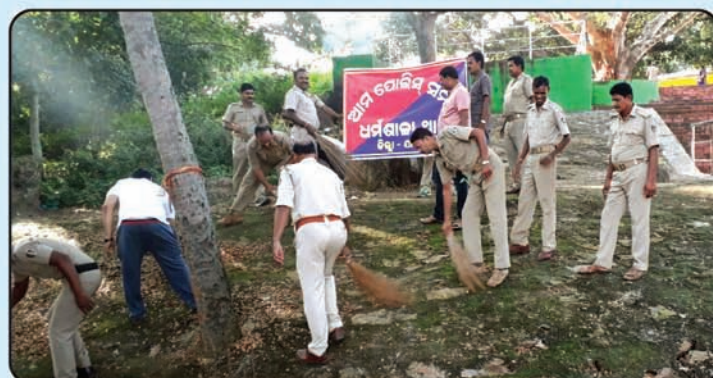
Cleanliness campaign by 'Ama Police Samiti' Dharmasala PS in Jajpur District