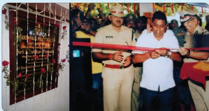
Sh Anubhav Pattnaik, Hon'ble MLA inaugurating the New Building of Khandapada PS in Nayagarh District