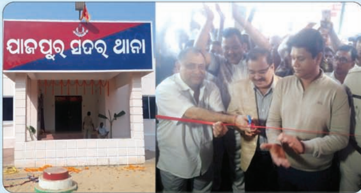
Inauguration of New Building of Jajpur Sadar PS