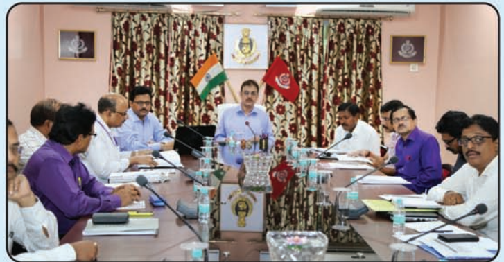
DGP presiding over the State Level Empowered Committee Meeting on CCTNS at Cuttack