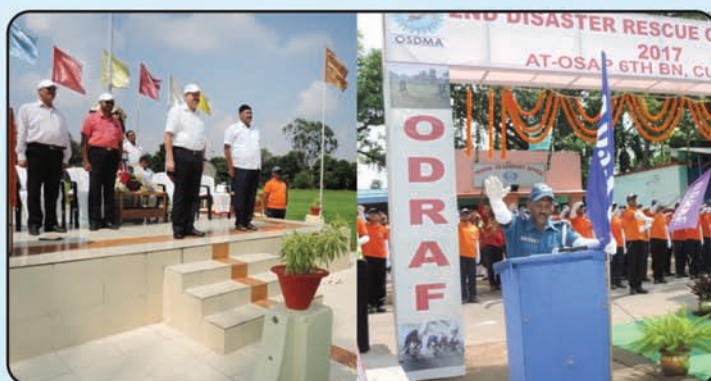
Disaster Rescue exercise at 6 th OSAP Bn., Cuttack