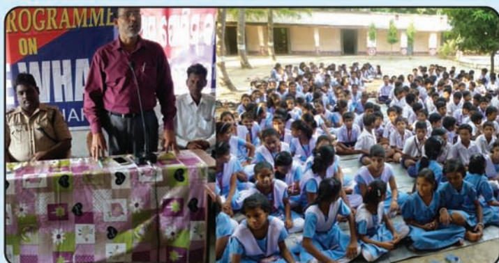
Bluewhale Awareness programme organized by 'Ama Police Samiti' Bhandaripokhari PS, Bhadrak