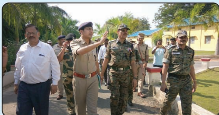
DGP visiting Koraput & Malkangiri District to review anti-Maoist operation in the region