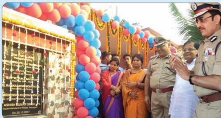
DGP inaugurating the Newly created Chandpur PS in Nayagarh District