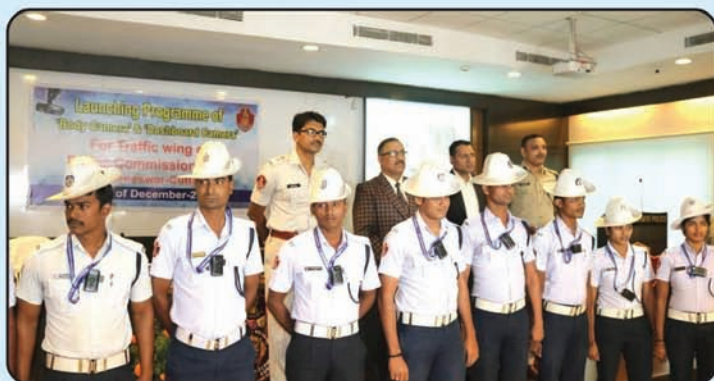
Distribution Ceremony of Body Camera to Traffic staff of Commissionerate Police Bhubaneswar-Cuttack