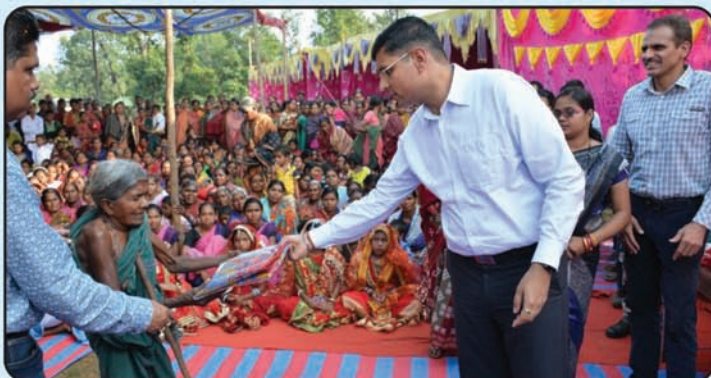
Sh Sanjeev Arora, SP, Sambalpur distributing sarees during Jana Sampark Sibir at village Gadgadbahal in Charmal PS