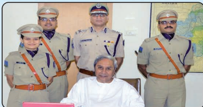
IPS probationers of 2016 Batch calling on Hon'ble Chief Minister