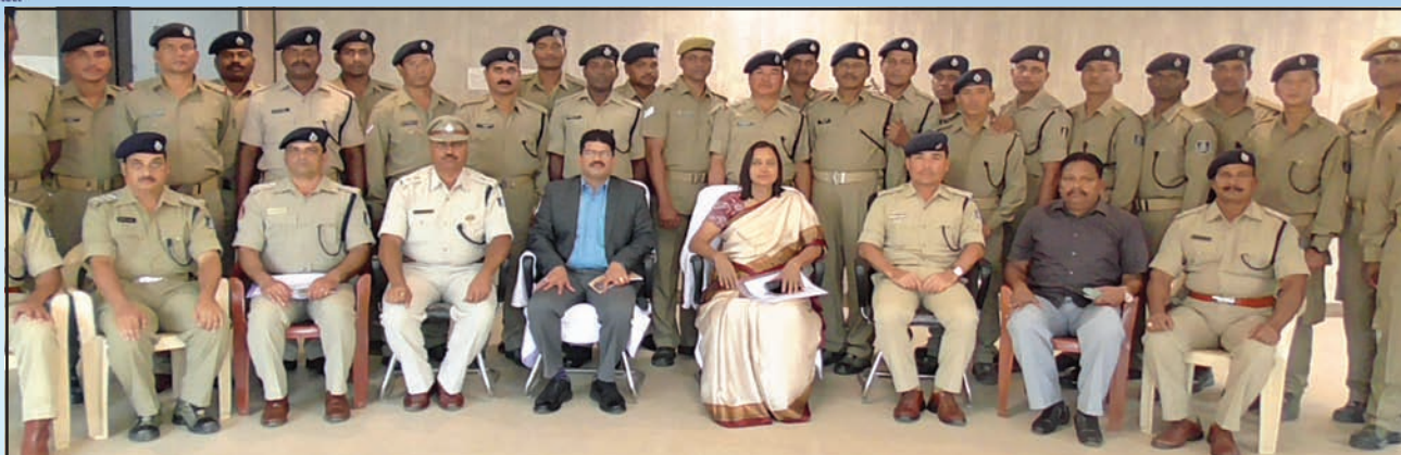
Odisha Police Shooting Team bagged 3 rd Position among the States in the 18 th All India Police Shooting (AIPDM) Competition, 2017 held at BTC (Basic Training Center) ITBP Camp, Panchkula, Haryana.