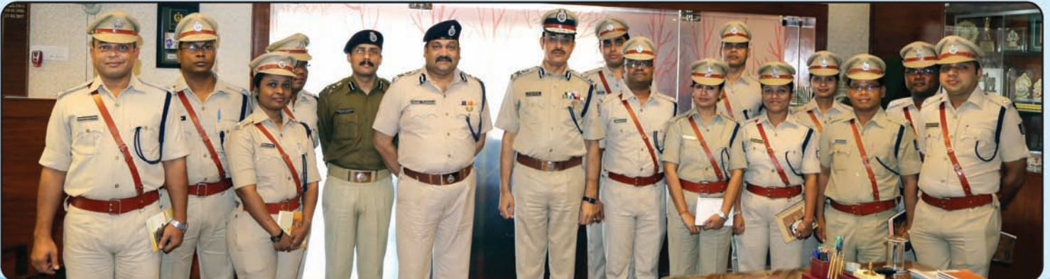
Directly recruited OPS probationers calling on DGP at Cuttack.