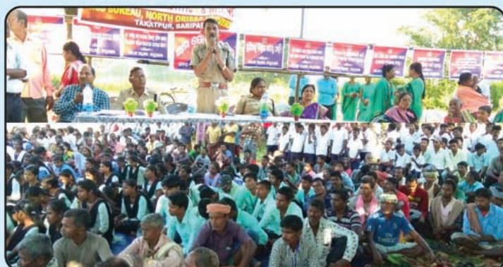
Witch Craft Awareness Programme by 'Ama Police Samiti' Baripada PS, Mayurbhanj