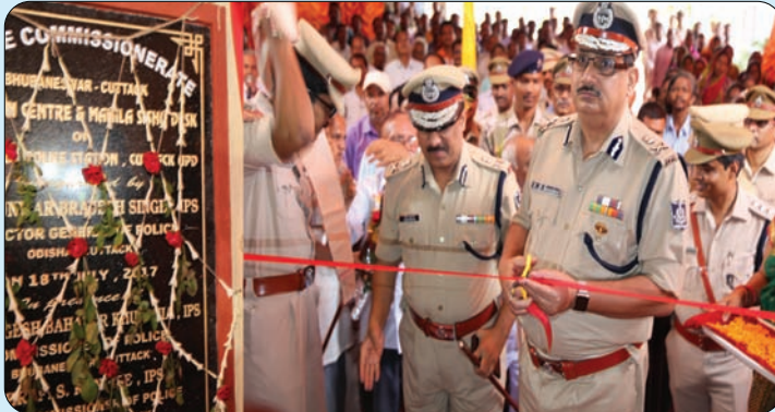
Sh KB Singh, former DGP, inaugurating the Reception Centre cum Mahila & Sishu Desk of Kandarpur PS in UPD Cuttack