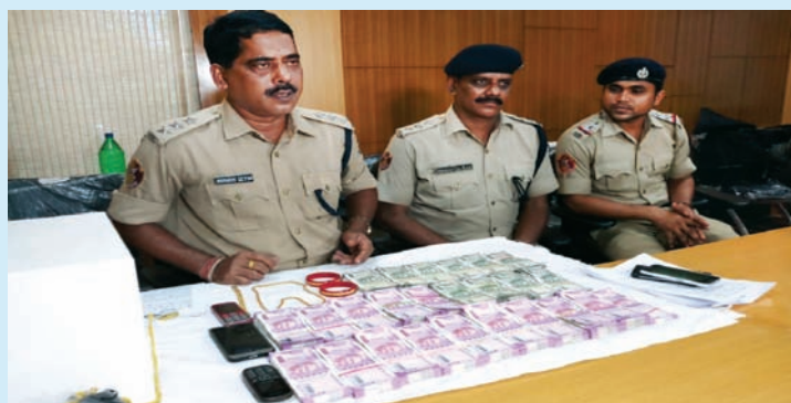
UPD Cuttack Police arrested two culprits and recovered cash of about Rs 32 lakhs and gold jewellery weighing 85 Grams.