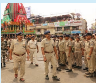
Former DGP with the Sr Police Officers