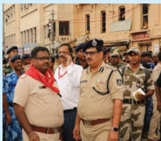
Former DGP discussing with SP Puri