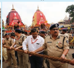
Pulling of Chariot by Former DGP and other Officers

The world famous RathaYatra of Lord Sri Jagannath, Sri Balabhadra and Goddess Devi Subhadra is celebrated in Puri for a period of twelve days every year. The deities begin their Yatra on the Suklapakshya Dwitiya Tithi of the holy month of Aasadha in three well decorated wooden chariots specially made every year for the occasion. More than one million devotees pull the chariots on the Grand Road, locally called Bada Danda for about three kilometres to the Gundicha temple. The deities are worshipped in the Gundicha temple for nine days. On the ninth day the deities begin their return journey to the main temple, known as Return Car Festival. Before entering the main temple, on the Ekadashi Tithi the deities are decked with gold ornaments on the chariots and this festival is known as Sunabesh. More than a million people turn up to witness the Sunabesh. Next day the deities return to sanctum sanctorum in the main temple in a ritual known as Niladree Bij.