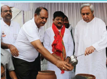
Hon'ble CM distributing a Tanka Torani at Karuna Camp