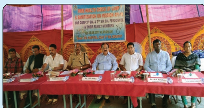
Free Health Check-up Camp Organised by 3rd OSAP Bn. Koraput