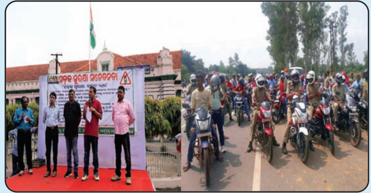
Traffic Awareness Campaign by Keonjhar Police