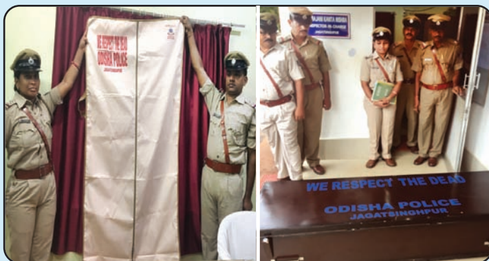
Provision of Deadbody Carriage Bags & Caskets for carrying unidentified deadbodies by Jagatsinghpur Police.