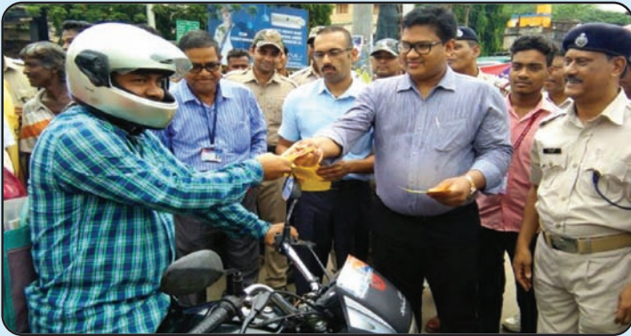
Traffic Awareness Campaign by Nayagarh Police