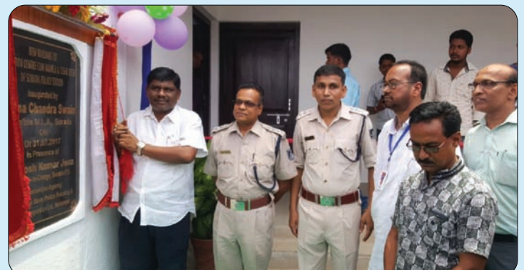
Sh Purna Chandra Swain, Hon'ble MLA, inaugurating the Reception Centre cum Mahila & Sishu Desk of Soroda PS