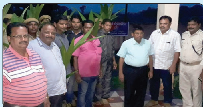
Plantation Programme by "Ama Police Samiti" Derabis PS, Kendrapara