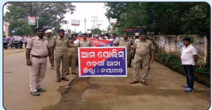
Traffic Awareness Campaign by "Ama Police Samiti", Odagaon PS