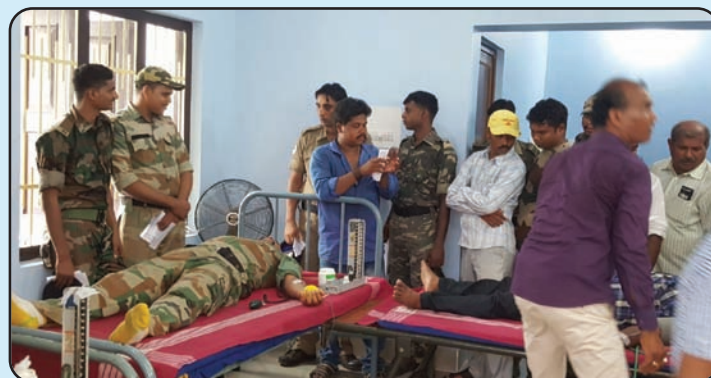
Blood Donation Camp Organised by "Ama Police Samiti", Sorada PS, Ganjam