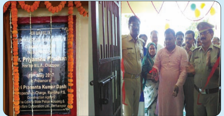
Sh Priyanshu Pradhan, Hon'ble MLA, inaugurating the Reception Centre cum Mahila & Sishu Desk of Rambha PS in Ganjam