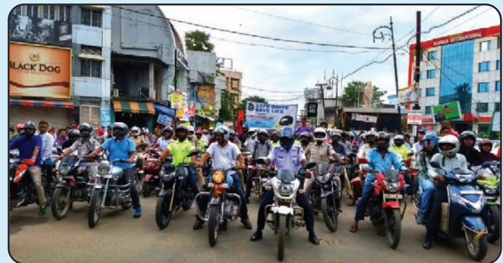
Traffic Awareness Motorcycle Rally by Berhampur Police