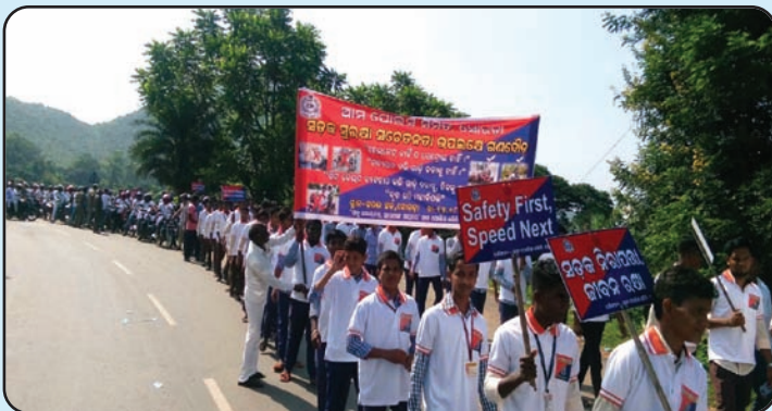
Traffic Awareness Campaign by "Ama Police Samiti", Sorada PS