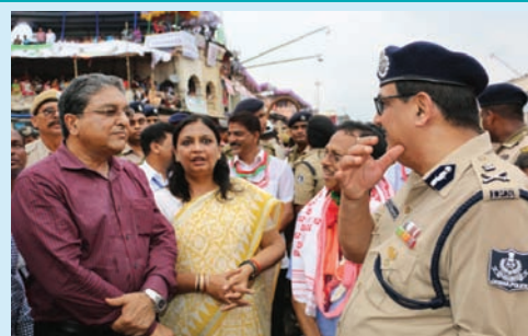
Hon'ble Chief Justice discussing with former DGP and other Officers.