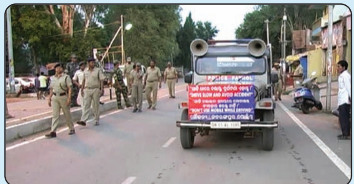
Traffic Awareness Campaign by Umarkote PS., Nawarangpur