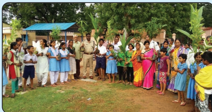
Plantation Programme by "Ama Police Samiti", Bhandaripokhari PS, Bhadrak