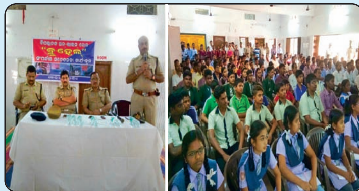
"Blue Whale" Awareness Programme organised by Jeypore PS in Koraput