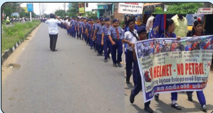
Road Safety Awareness Rally by "Ama Police Samiti" Aska PS