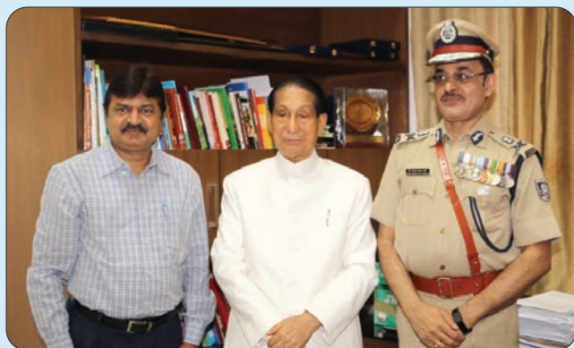
DGP calling on Hon'ble Governor