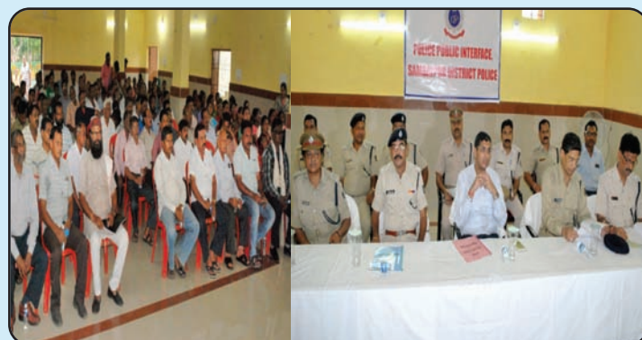
Sh Sanjeev Arora, SP, Sambalpur presiding over the Police Public Interface Meet at Sambalpur