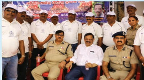
Sr Officers in the OP Association Camp at Lion's Gate