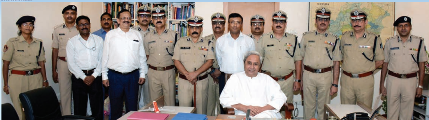
Additional CS Home Department, DGP Odisha along with Senior Police Officers greeting Hon'ble CM for being chosen as the Best Administrator by Outlook Magazine