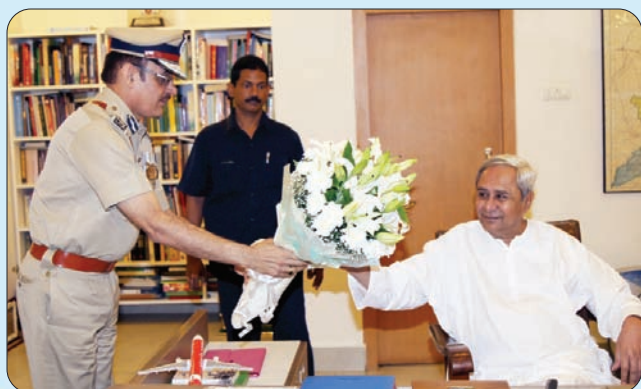
DGP calling on Hon'ble Chief Minister