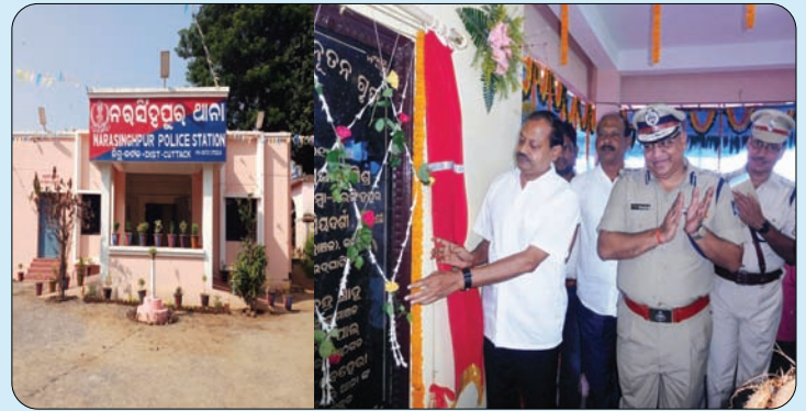
Sh Debi Prasad Mishra, Hon'ble MLA, inaugurating the new building of Narasinghpur PS