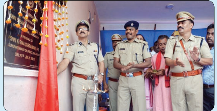
Sh SK Nath, IGP NR, inaugurating the new building of SDPO Office, Bolangir