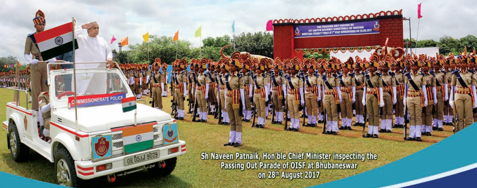
Sh Naveen Patnaik, Hon'ble Chief Minister inspecting the Passing Out Parade of OISF at Bhubaneswar on 28 th August 2017