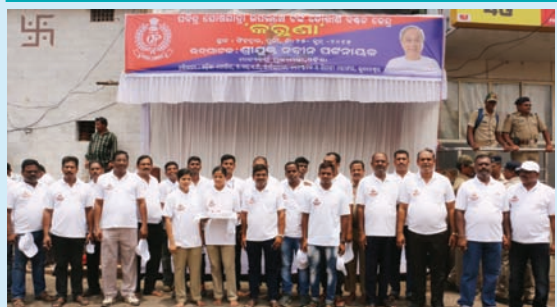
Karuna Camp organised by Odisha Havildar, Constable & Sepoy Confederation at Lion's Gate