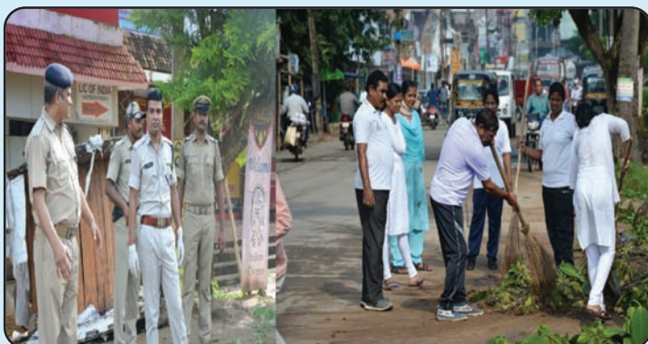
Sh Jai Narayan Pankaj, SP leading the "Cleanliness Drive" by from IB Square to LIC Office conducted by Jagatsinghpur Police