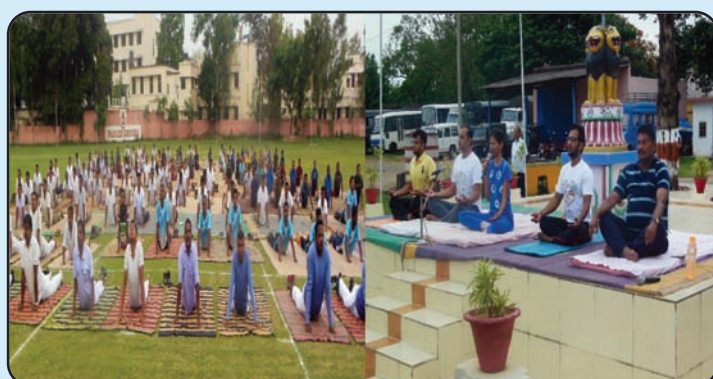
Yoga Camp Organised By 6th OSAP Bn, Cuttack