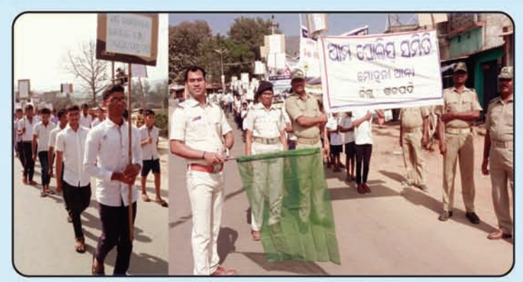
Road Safety Awareness Rally by "Ama Police Samiti", Mohana PS in Gajapati District