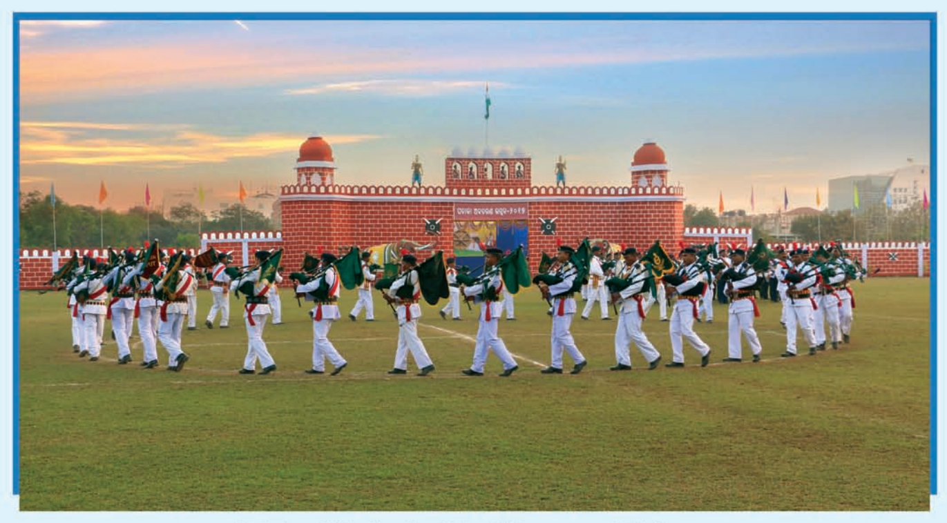
State Level "Beating the Retreat" Ceremony at Bhubaneswar