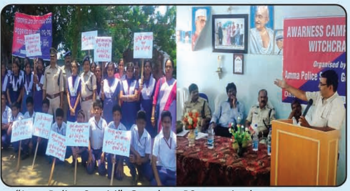
"Ama Police Samiti", Gopalpur PS organised an awareness programme on anti Witch Craft