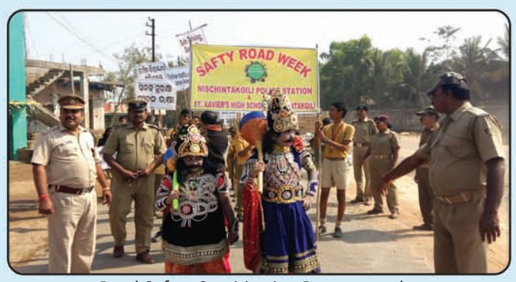
Road Safety Sensitisation Programme by Nischintakoili PS in Cuttack District