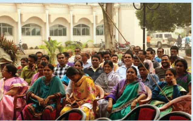
Get together on the occasion of New Year 2017 at State Police Headquarter, Cuttack.