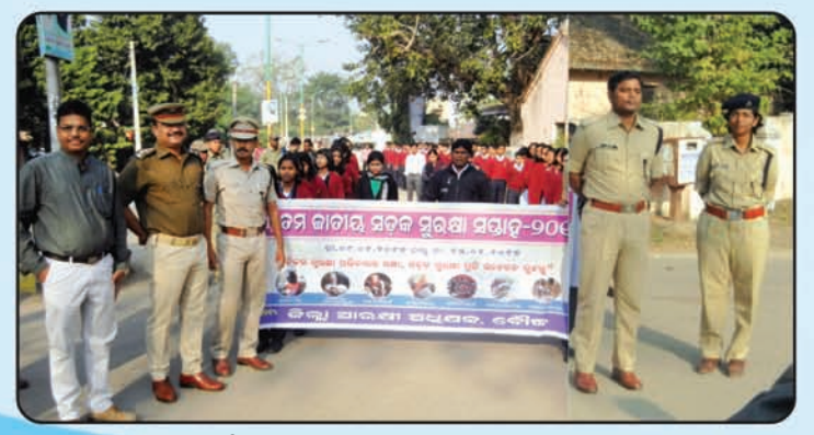
Road Safety Awareness Rally by Boudh Police