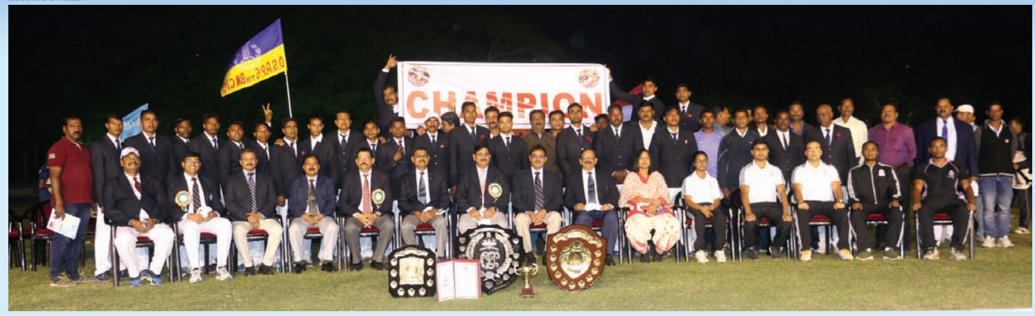
Athletes of 6th Bn, Cuttack, the Champion Team in the State Police Athletic Championship 2016 with DGP and Senior Police Officers