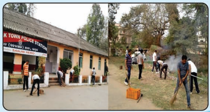
Cleanliness drive by Bhadrak Police