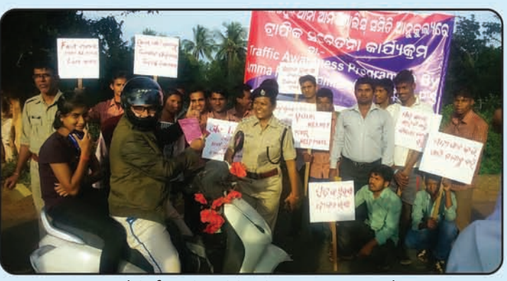
Road Safety Sensitisation Programme by "Ama Police Samiti", Gopalapur PS