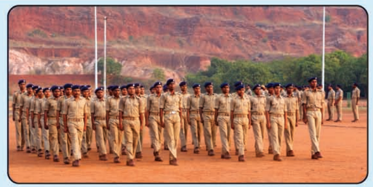
Training of Newly recruited Sub-Inspectors/Sergeants at Police Training Institute, Byree, Jajpur