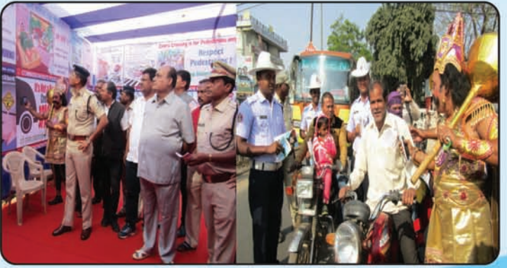
Road Safety Awareness Programme by UPD, Cuttack