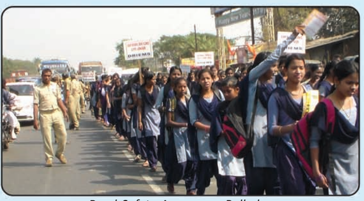
Road Safety Awareness Rally by "Ama Police Samiti", Tangi PS, Cuttack District