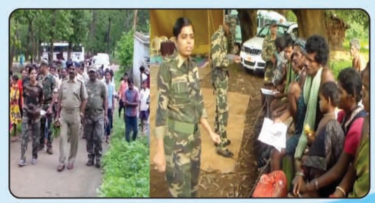
"Janasampark Sibira" organised by Deogarh Police.