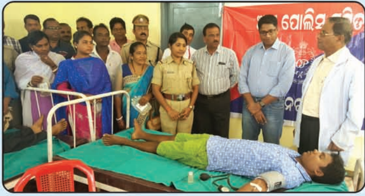
Blood Donation Camp organised by "Ama Police Samiti", Kalinga Nagar PS Jajpur.