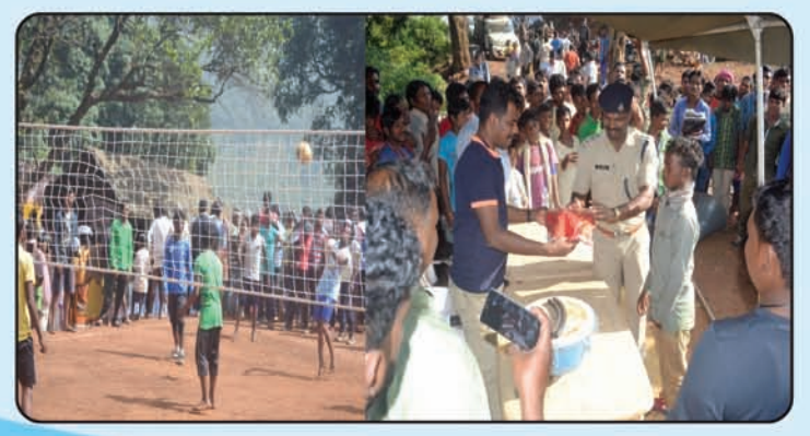
"Janasampark Sibira" organised by Rayagada Police.