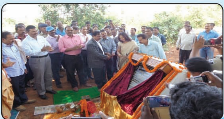
Smt B Radhika, ADGP, SAP laying the foundation stone of Office Building of 1st Bn, OSAP Dhenkanal