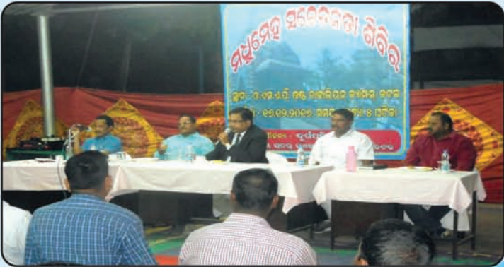
Diabetes Sensitisation Programme at 6th OSAP Bn, Cuttack