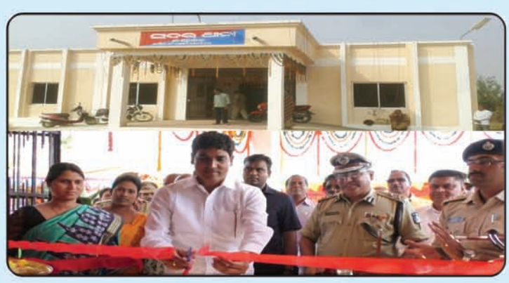
Hon'ble Minister, Law & PR Sh Arun Sahu inaugurating the new building of Sadar PS, Nayagarh