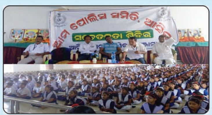
Traffic Awareness Programme by "Ama Police Samiti", Asika PS