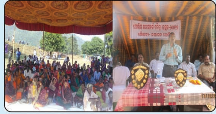
"Janasampark Sibira" organised by Nayagarh Police.