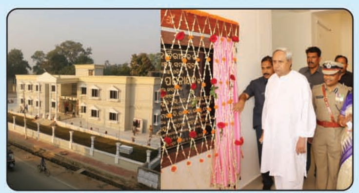
Hon'ble CM inaugurating the office building of DIGP NR Sambalpur