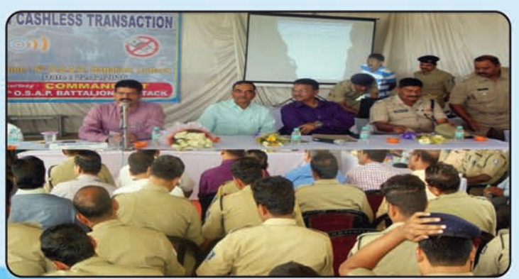
Cashless Transaction Awareness Programme organised by SAP at 6th OSAP Bn, Cuttack