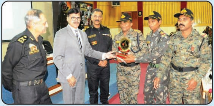
Bomb Detection and Disposal Squad of Odisha Police bagged Championship Award at the National Counter IED Joint Exercise held at NSG Campus, Maneswar, Haryana