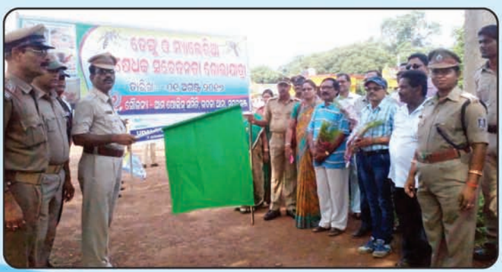
Dengue & Malaria Awareness Campaign by "Ama Police Samiti", Udala PS, Mayurbhanj