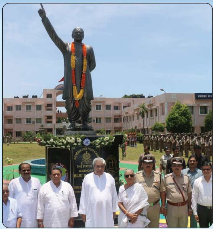
Sj Naveen Patnaik, Hon'ble CM inaugurates the statue of Late Biju Patnaik at BPSPA, Bhubaneswar on 29 July 2016.