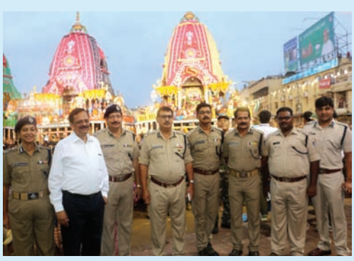
DGP with Senior Police officers on the day of Suna Besa