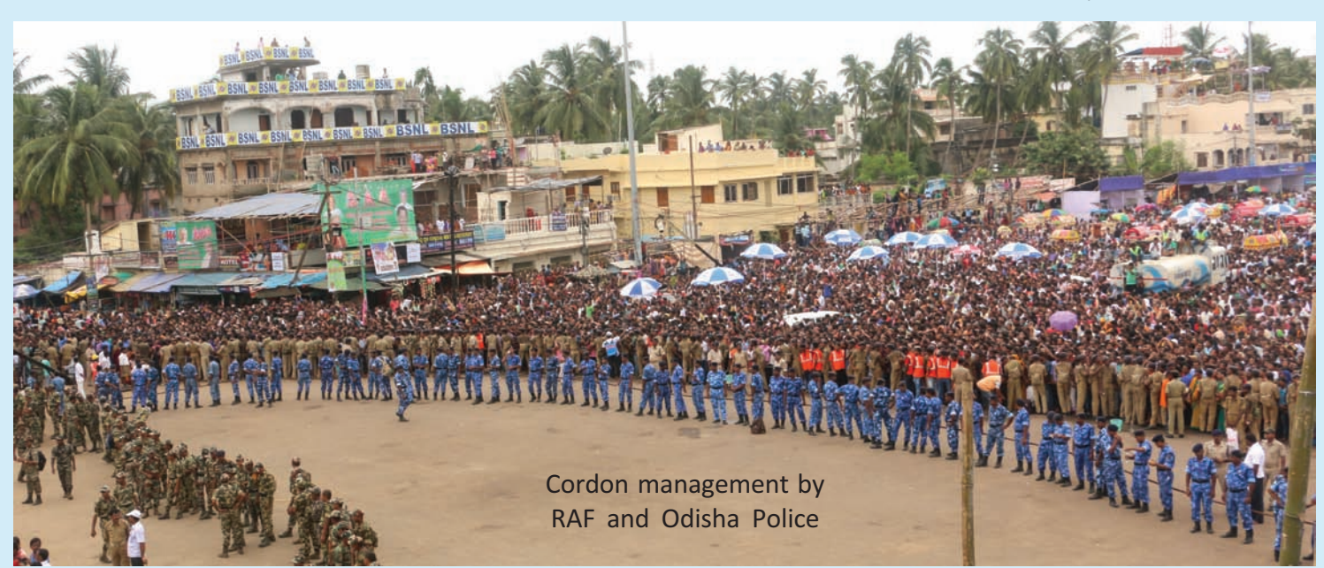
Ratha Yatra begins on Sri Gundicha day and concluds on Niladri Bije with different rutuals spanning over a period over 12 days. Sri Gundicha, Bahuda & Suna Besa attracted more than two million crowd for which elaborate police arrangements were made.