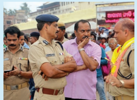
Senior police officers with RDC, CD