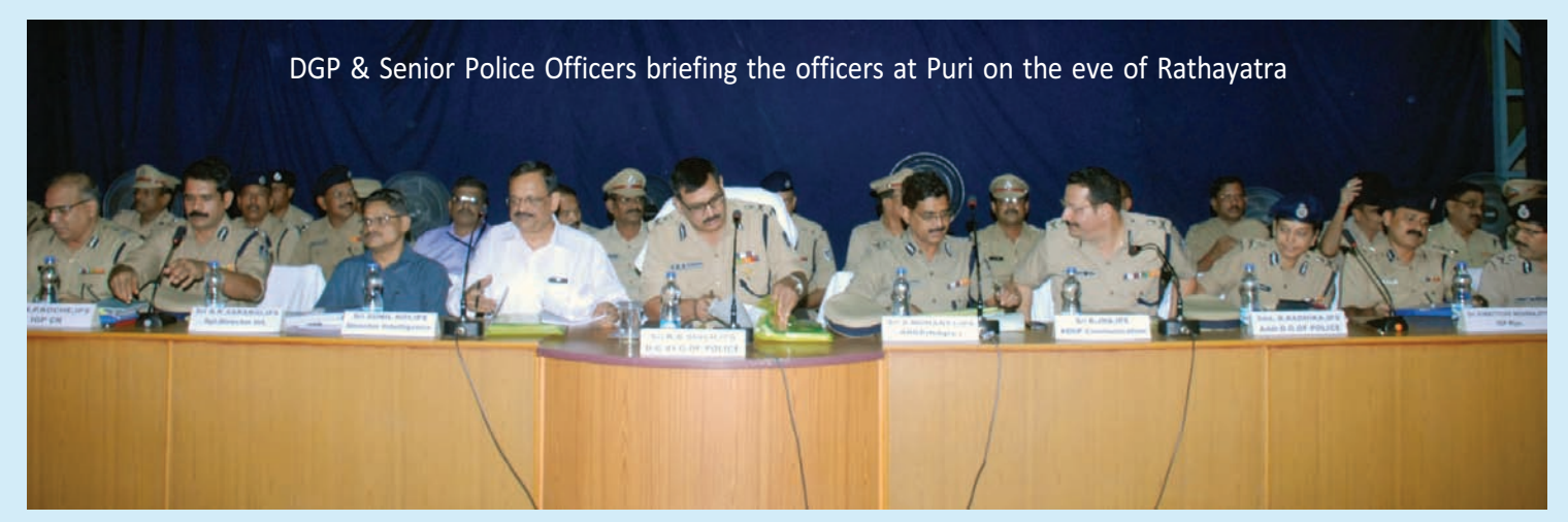
Elaborate Police arrangement was made for the smooth conduct of Car Festival at Puri. 130 Platoons of Force, 2 Company of Rapid Action Force, 2 Units SOG, 3 Units ODRF and 470 AET Trainees were deployed during the 12 day long festival. 16 SsP/Commandants, 26 Addl. SsP, 52 D.S.Ps, 82 Inspectors, 542 S.Is/A.S.Is & 2000 Home Guards were also engaged for this mega annual event.