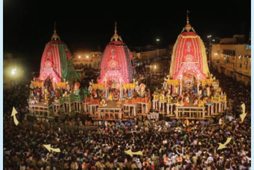
Mobility plan during "Suna Besa"