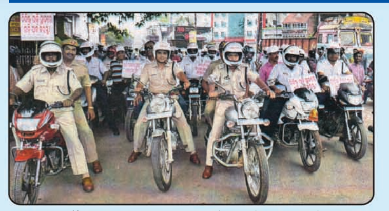
Traffic Awareness Campaign by Berhampur Police