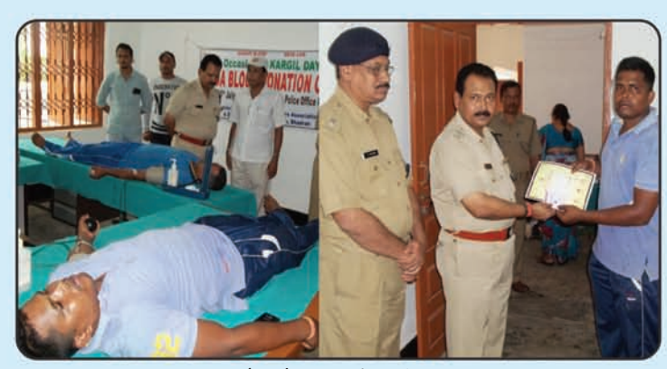
Blood Donation Camp organised by Bhadrak Police