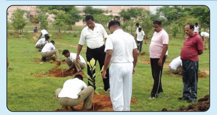
Plantation of more than 500 fruit bearing trees in 5th IR Bn, Boudh campus