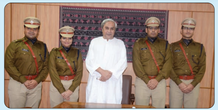
Four IPS Probationers of 2014 batch of Odisha Cadre call on Hon'ble CM