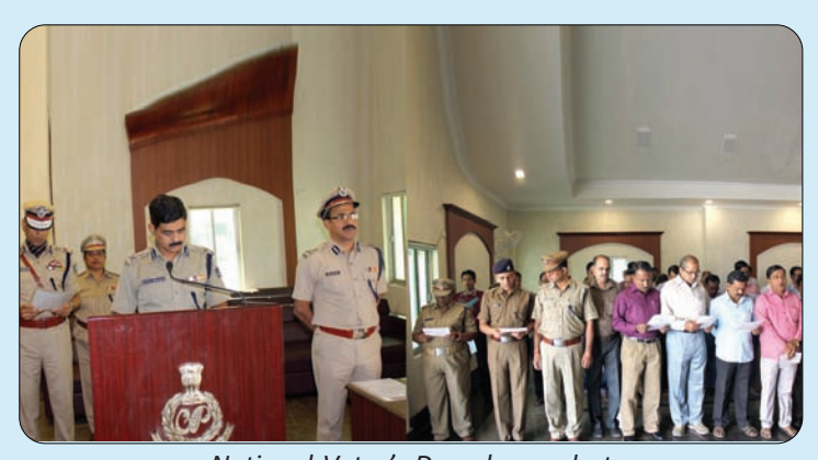
National Voter's Day observed at State Police Headquarters Cuttack