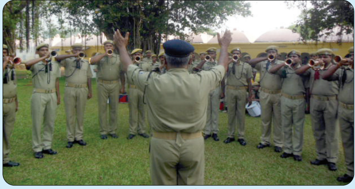
Bugle training at 6th Bn., Cuttack