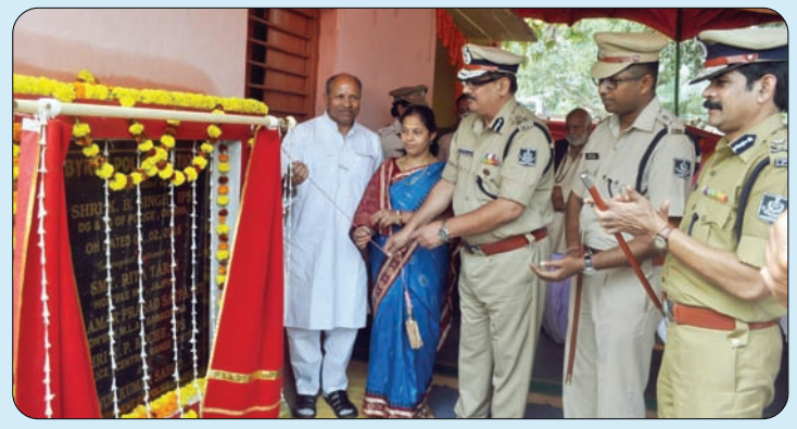
DGP inaugurates Byree Police Station building