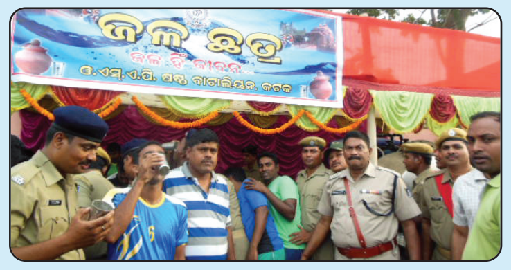
"Jala Chhatra", free drinking water for public during summer, arranged by 6th Bn. at OMP Square, Cuttack.