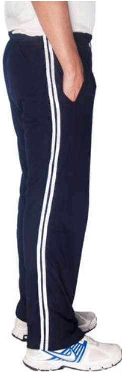
NAVY BLUE TRACK PANT