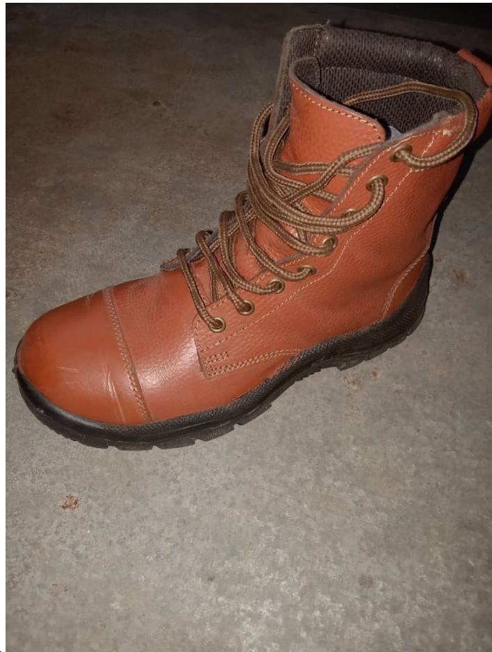
BROWN BOOT OFFICER (DMS)