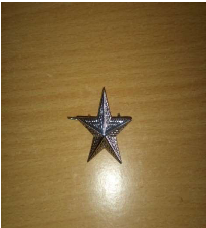
FIVE POINTED STAR