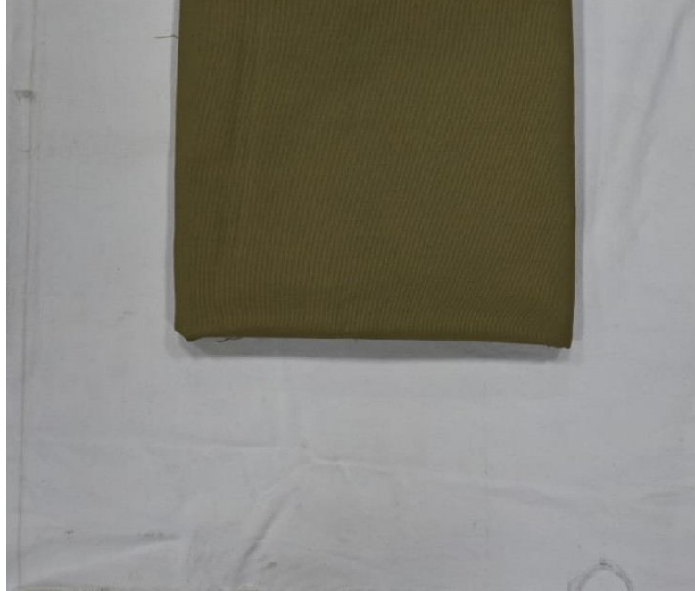
KHAKI TERRY-COTTON (T/C) CLOTH (The shade of the cloth shall match this)