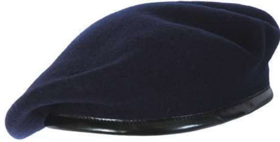
NAVY BLUE BERET CAP