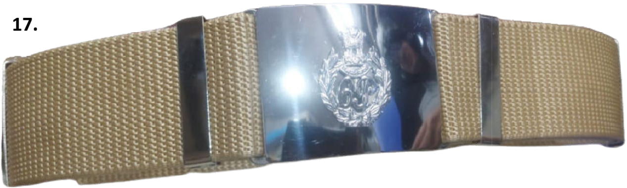
KHAKI NYLON BELT WITH BELT PLATE