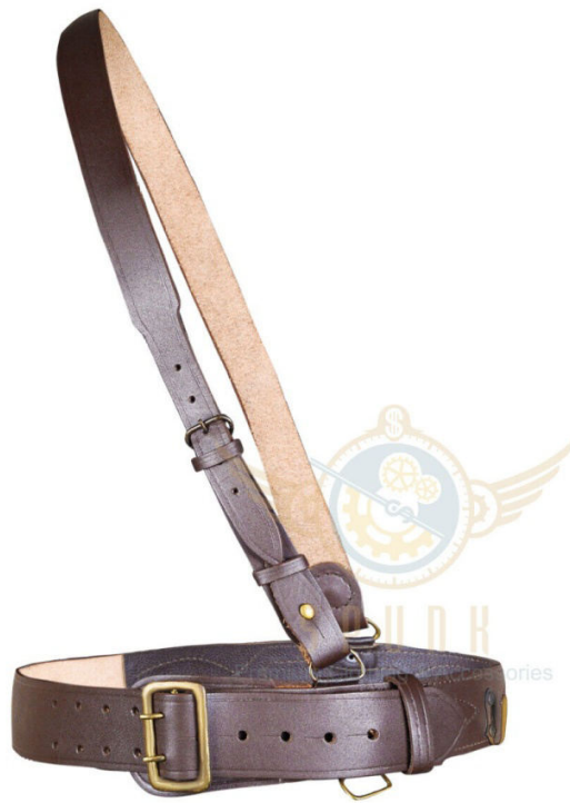
SAM BROWNE BELT