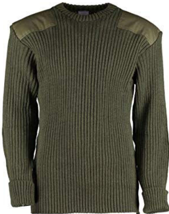
DARK GREEN WOOLEN JERSEY