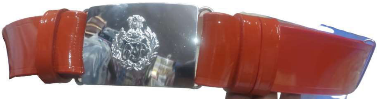
BROWN LEATHER BELT WITH BELT PLATE