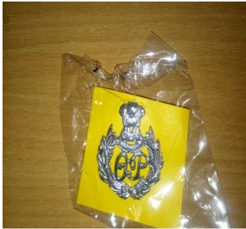
ODISHA POLICE MONOGRAM (Cap Badge)