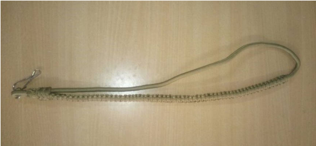
KHAKI LANYARD BRAIDED