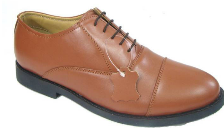
OXFORD SHOES BROWN