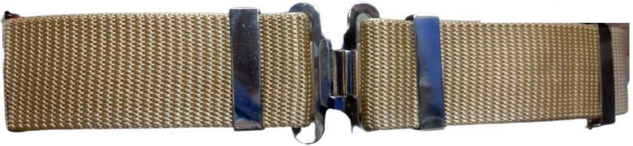
KHAKI NYLON BELT WITH BUCKLE